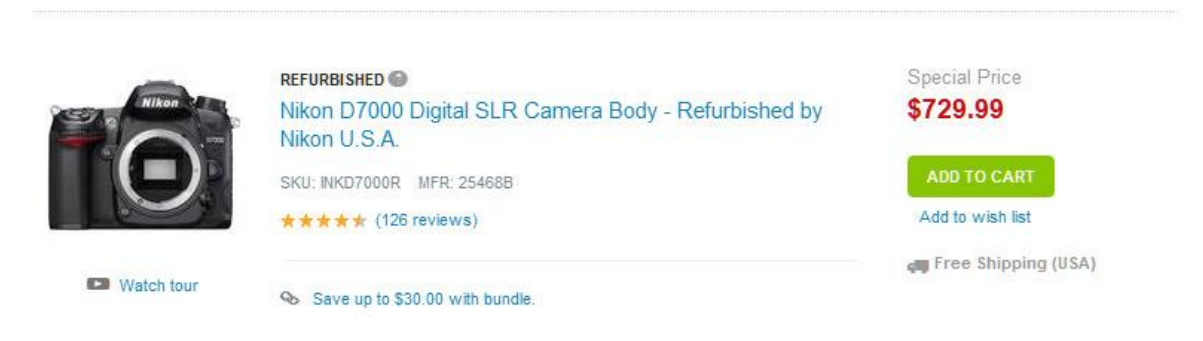
e.g. 1 col list view

A) Consider adding a 2 column and 1 column product grid to test against 3 column. As we recommend you reduce width of template down to 640px.